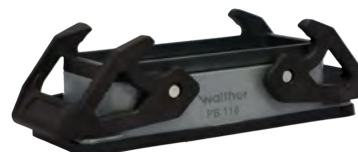
PB116 B16 Panel Housing 1.06in or 27mm high Double Locking System