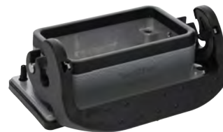
PB110 B10 Panel Housing 0.87in or 29mm high Double Locking System