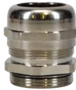
30104049 Strain Relief

APPLICATIONS: subunits of injection molding machines like heater, fan, control terminals, industrial lightning, small drives, vibratory conveyors, connections inside cabinets and much more