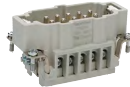
MS210 B10 Male Insert Screw Terminal with wire protection 20-14 AWG