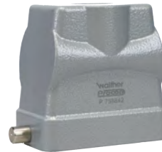
P758842 Hood B10 Top Entry Single Locking System 1x M25 or 1" diameter