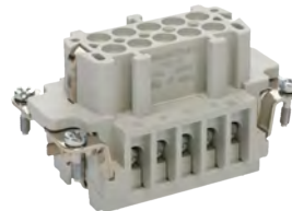
FS110 B10 Female Insert Screw Terminal with wire protection 20-14 AWG