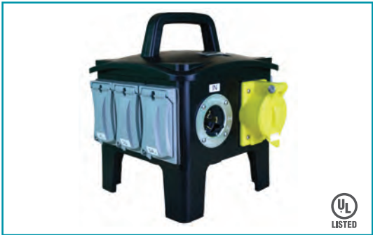
PORTABLE POWER DISTRIBUTION Temporary power box fitted with multiple outputs. Stock and custom units available