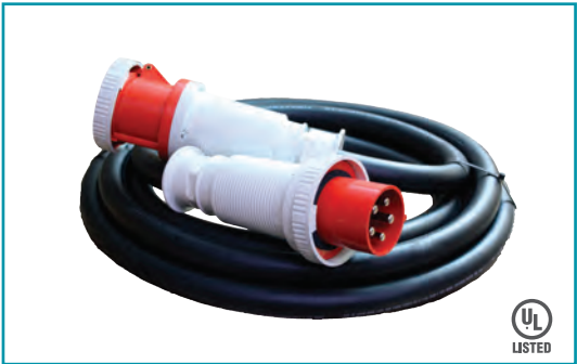
CABLE ASSEMBLIES Standard stock in 25ft, 50ft, & 100ft. Custom configurations are available