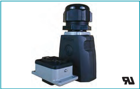
PROCON HEAVY DUTY CONNECTORS Safe, error-free power connection designed for tight spaces