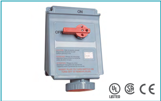
MECHANICAL INTERLOCK DEVICES Designed to combine a disconnect switch and receptacle into one compact unit