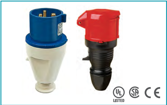
PIN & SLEEVE DEVICES Manufactured to IEC 60309-1 & 2 standards and are interchangeable anywhere in the world