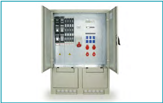
POWER DISTRIBUTION SYSTEMS Custom-built distribution systems optimizing power from substation to individual load